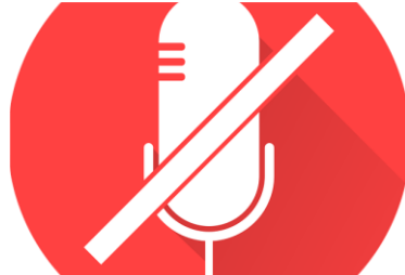
Mute when not speaking