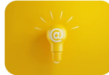
WA.MarketDevelopment@aemo.com.au for other questions