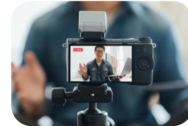
Meetings are recorded for the purpose of taking meeting minutes