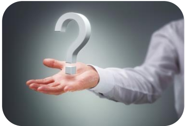
Keep questions on topic