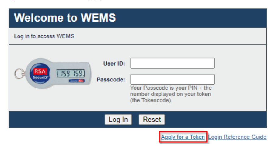
Figure 8 AEMO Website - Accessing WEMS