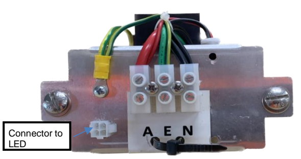
LED Driver Tray