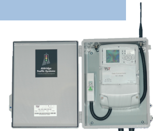
Remote Cabinet (IP65) - Cat #: RM240 H:400 W:300 D:150