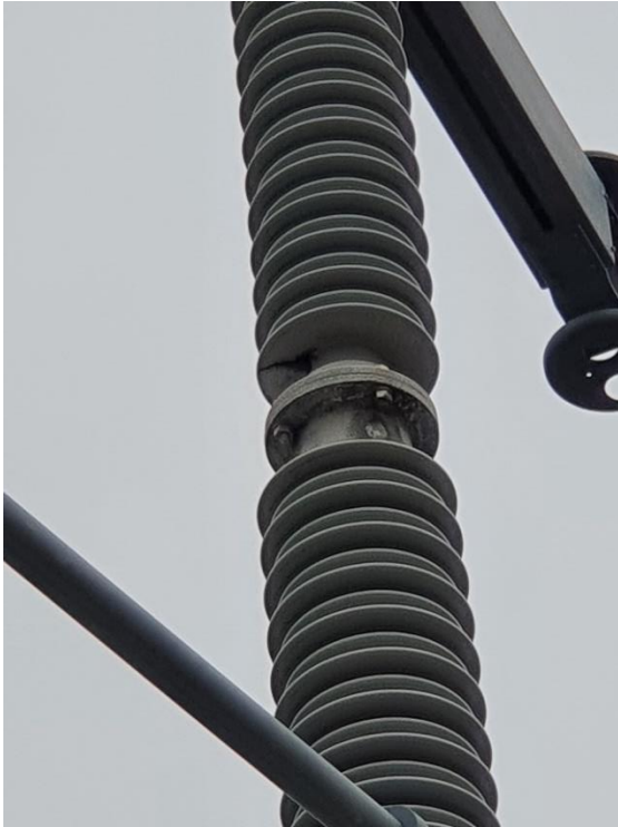
Red Phase – East side insulators (South aspect)