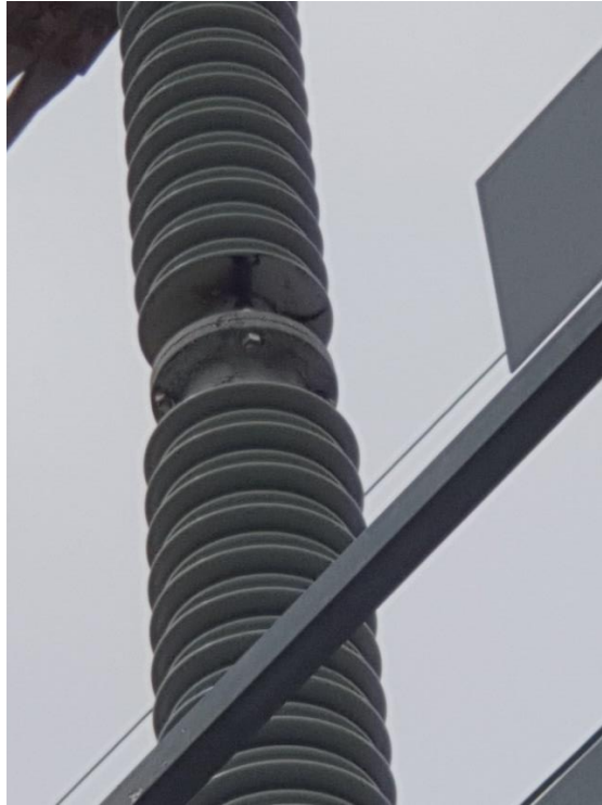
Red Phase – East side insulators (West aspect)