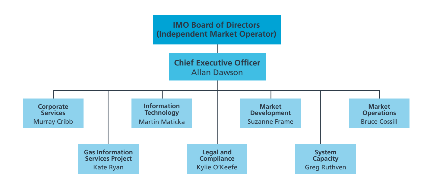
Figure 1. IMO Organisational Chart