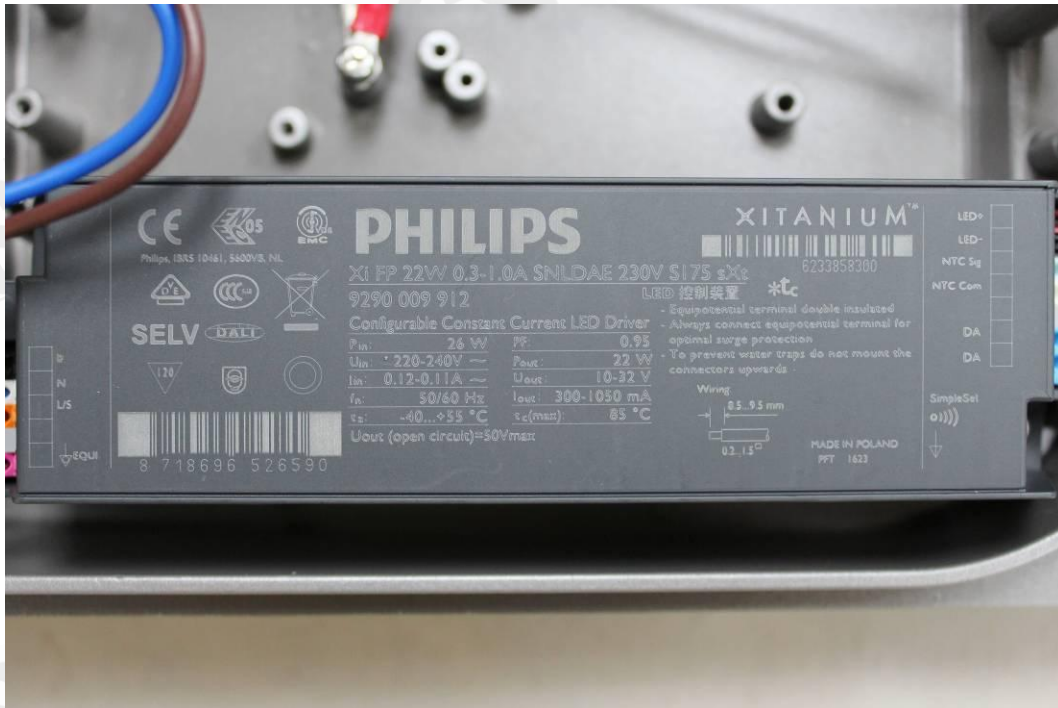
Control Gear - End of Report -

Unless otherwise stated the results shown in this test report refer only to the sample(s) tested. This test report cannot be reproduced, except in full, without prior written permission of the Company. 除非另有說明，此報告結果僅對測試之樣品負責。本報告未經本公司書面許可，不可部份複製。