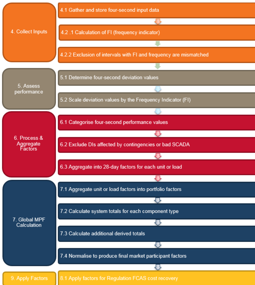
Figure 1 Overview of calculation process