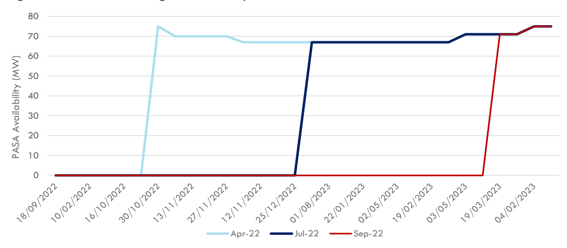
Figure 1 Generator changed availability while in maintenance

Figure 1 shows an example where a generator participant has rescheduled the return to service of a particular unit due to unexpected complications. Forecasts based on the original method overestimate supply availability for affected periods because the possibility of future outage extensions is not simulated.