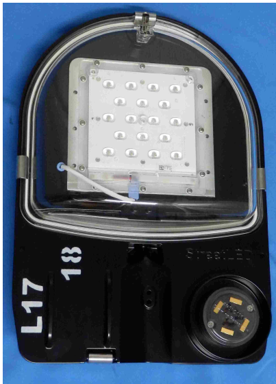
Illustration 2: Luminaire