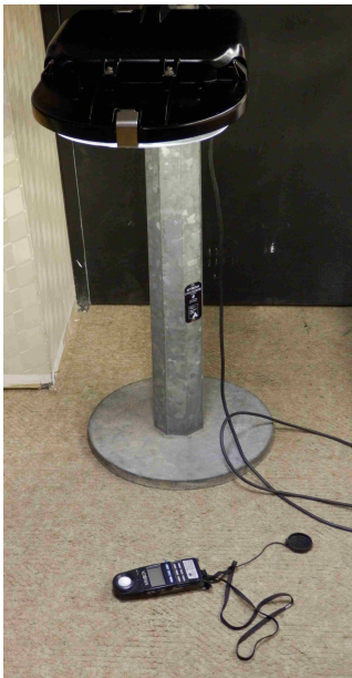
Illustration 5: Setup