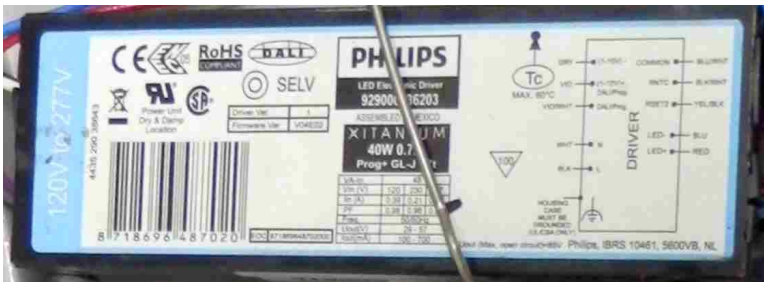
Illustration 4: LED driver