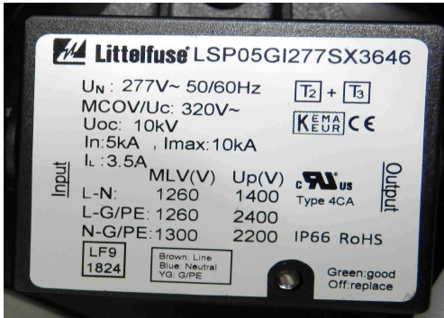
Illustration 3: Surge protector